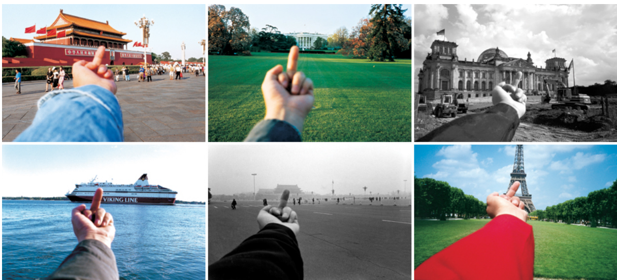
Ai Weiwei, Study of Perspective: (clockwise) Tiananmen, Beijing, China; The White House, Washington D.C., USA; Reichstag, Berlin, Germany; Eiffel Tower, Paris, France; Tiananmen, Beijing, China; Viking Line Ferry

This Fake word has created many debates, because in China its pronunciation sounds a little like a bad word, the same that often comes back during Weiwei's career. In 2000, for instance, when he installs an exhibition called F*** Off – Uncooperative Attitude, set on the side of the Shanghai Biennale and which represented a very important milestone for his evolution as an international artist. Clearly, even only from this kind of choices, we can acknowledge that his own attitude goes against the Government, and will not stop doing so in many of his works, like the Study of the Perspective, where he shows his middle finger in front of every important monument or institution around the world (The Forbidden City with Mao's portrait included).