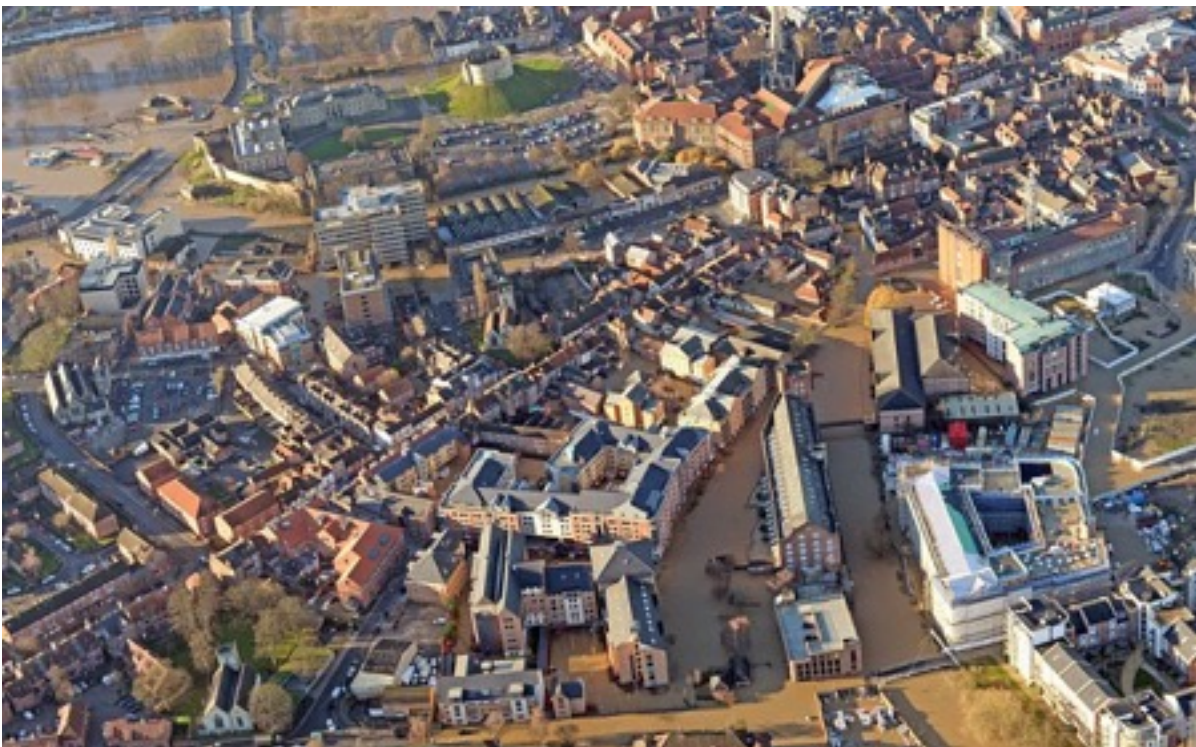
Dramatic aerial footage shows the devastation of the flooding across York