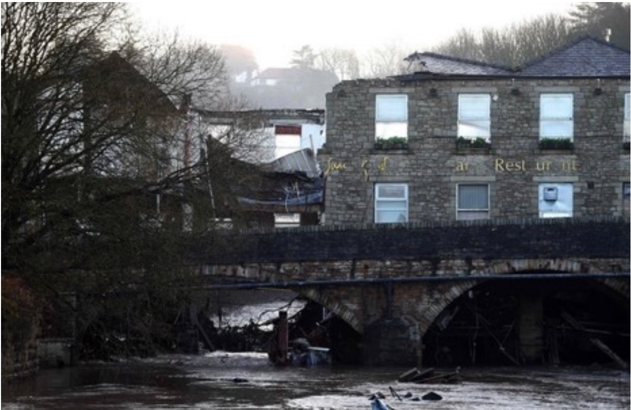
A 200-year-old pub was among the buildings damaged around Manchester, England, over the weekend.

In those concerning moments the Prime Minister Cameron himself released an interview for the BBC stating that “(...)the level of rivers plus the level of the rainfall has created an unprecedented effect”. Despite how unprecedented this flooding has been, Britain has indeed experienced several large floods recently. Even though these past events instigated some criticism towards the Government this last flooding incident has prompted a larger debate about the Role of Great Britain in environmental policies and its investments in researching the effects of climate change.