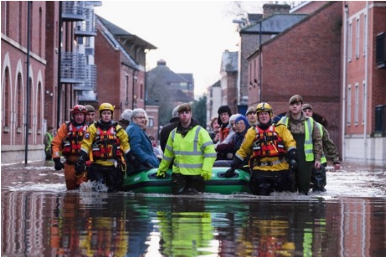
British soldiers and emergency workers evacuated residents in York, England, on Sunday after large swathes of the country's north were hit by flooding.

What England experienced waking up on Boxing day last year was far from being a “holy” day.