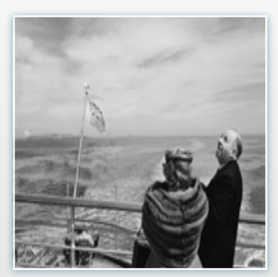
Ms. Maier's pictures capture people in their most intimate moment. They never pose, they are caught absorbed in their thoughts or in their routine but at the same time they are upstanding, fragile or strong, rich or poor, funny maybe but never ridiculous.