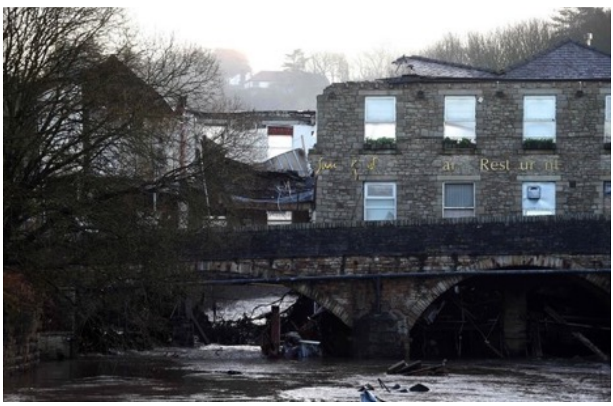
A 200-year-old pub was among the buildings damaged around Manchester, England, over the weekend.

In those concerning moments the Prime Minister Cameron himself released an interview for the BBC stating that "(...)the level of rivers plus the level of the rainfall has created an unprecedented effect". Despite how unprecedented this flooding has been, Britain has indeed experienced several large floods recently. Even though these past events instigated some criticism towards the Government this last flooding incident has prompted a larger debate about the Role of Great Britain in environmental policies and its investments in researching the effects of climate change.