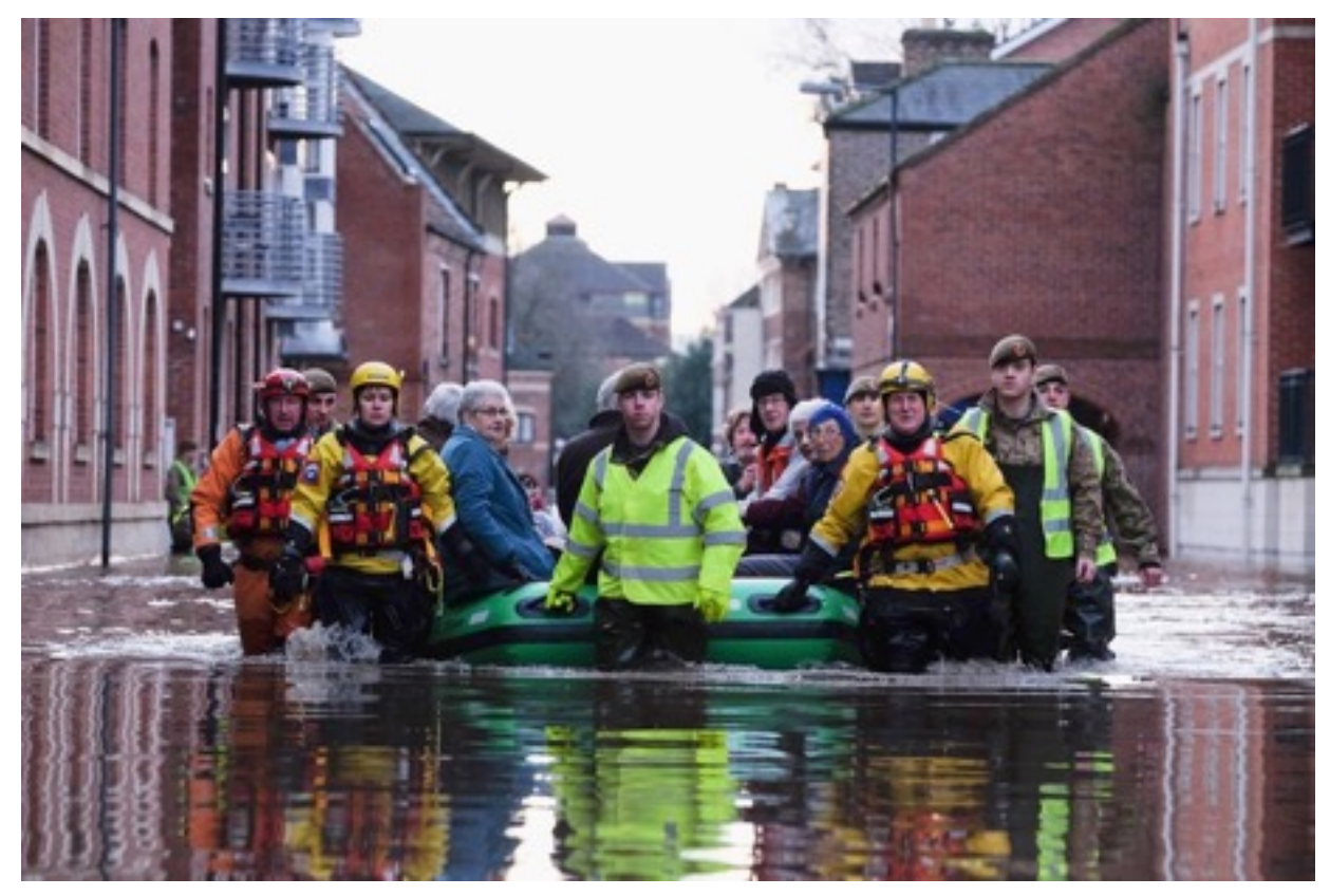
British soldiers and emergency workers evacuated residents in York, England, on Sunday after large swathes of the country's north were hit by flooding.

What England experienced waking up on Boxing day last year was far from being a "holy" day.