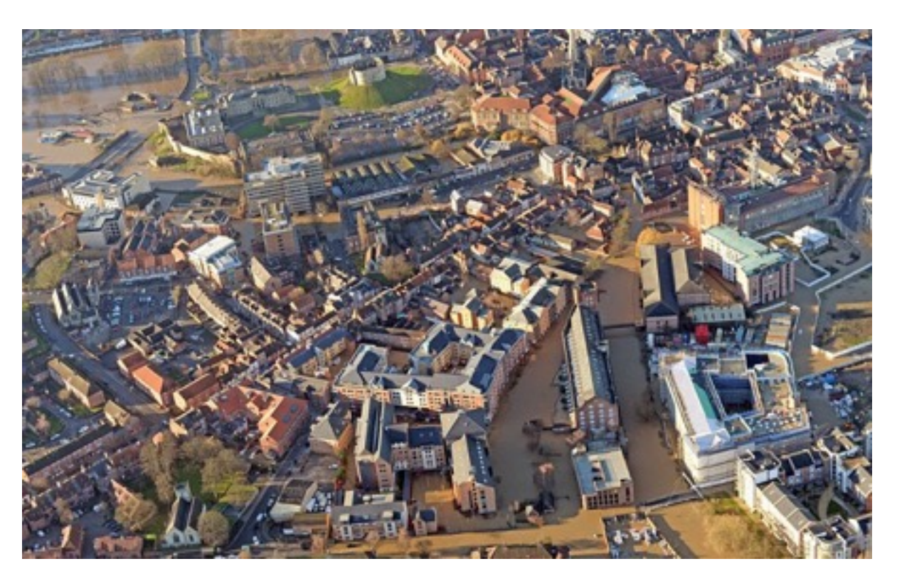
Dramatic aerial footage shows the devastation of the flooding across York